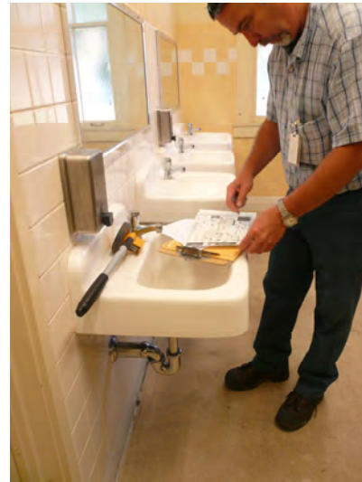
Contractor measuring the new height of bathroom sinks