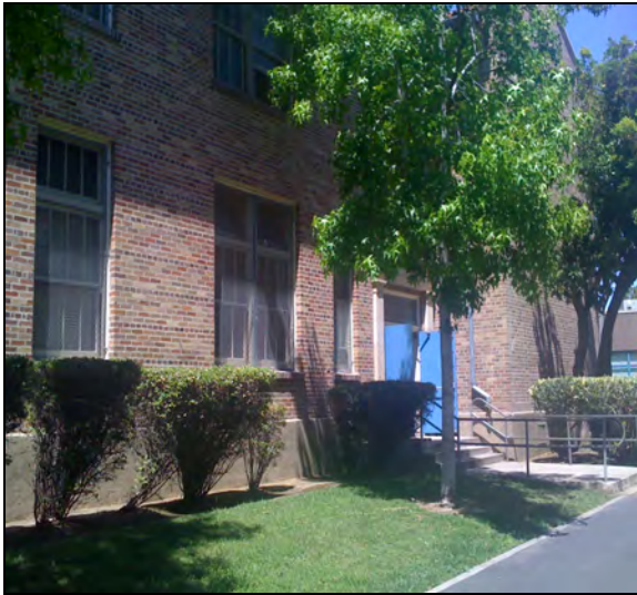
CWC courtyard site & future location of fenced partition

As you can imagine, we've been quite busy getting our site ready and finalizing our co-location agreement with LAUSD. In our regular visits to the site in the past weeks, we've found furniture being removed, deep cleaning of classrooms happening and work with contractors beginning. The largest scale construction projects we have going on this month and next are: 1) the installation of fences, interior and exterior partitions to separate CWC from the main Le Conte campus, 2) the build-out of CWC's separate drop-off/pick-up area, 3) the conversion of Le Conte bathrooms for use of younger students. Yesterday, I found several of the rooms not only having been cleaned deeply but hard wood floors waxed and buffed – shiny and stunning! This work will continue into August and we'll have continuous updates to share. In the meantime, a few photos below of the progress: