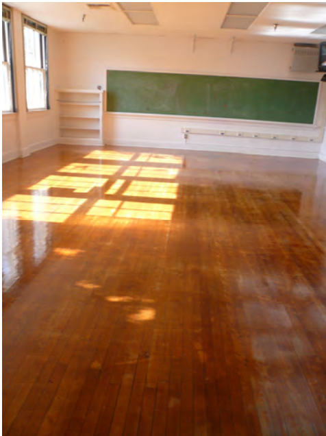
Clean classroom with newly waxed floors